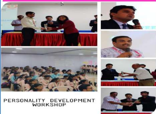
PERSONALITY DEVELOPMENT WORKSHOP

Two days "Personality Development Workshop - Joint Venture by YBCODP and Rubicon Pune" 28-29th Sep 2019